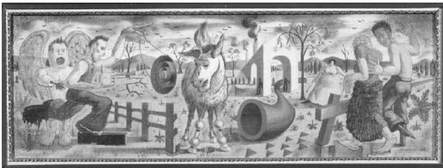
George Marinko, "Vanity Fair," 1941. Collection of the Mattatuck Museum

This strange, "regionalist" landscape, on display in the 20th Century Art Gallery, is filled with classical and religious structures and figures, animals, clowns and everyday artifacts. Many of Marinko's works, as this here, had allusions to the temptations of Adam and Eve and other suggestions of male/female conflict.