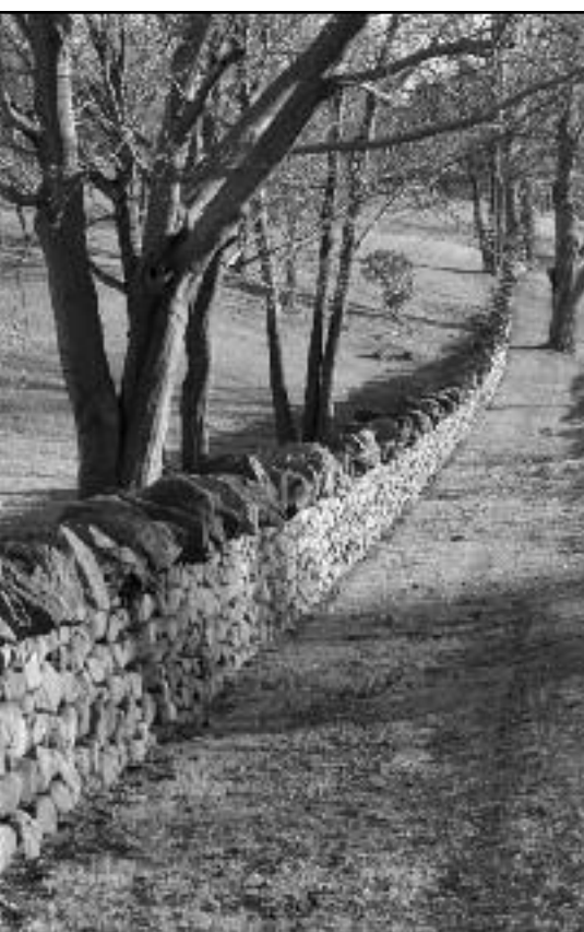
Artillery Road in Middlebury, CT