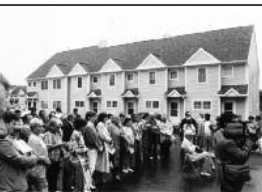
The 1991 ribbon-cutting ceremony for the Brookside Community, a Limited Equity Co-operative providing affordable home ownership.